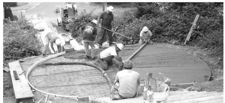
Seattle Dept. of Transportation crew pouring the Hillclimb stairway landing. After the landing was poured, they stamped a pattern of raindrops and cherry blossoms.

Again, FCH invites your participation in the Hillclimb project. Your cash, in-kind, and labor donations are crucial for completing this project. And we always welcome your help at the monthly maintenance parties ( 4th Saturdays, 10:00-12:00, March through October ). Email us at info@charlestownhillclimb.org for information or to be added to our email list. You can also find more information about the Hillclimb on our Web site: www.charlestownhillclimb.org .